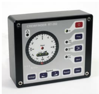
POM housing (standard)