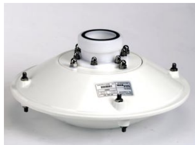
Screw flange (standard)