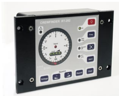
Aluminum housing with panel mounting brackets